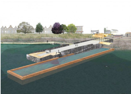
One of Konishi Gaffney Architects' winning designs of Kilcreggan foreshore improvements

Glasgow Institute of Architects, Rosneath Peninsula West Community Development Trust and Community Links Scotland announced the winner of their architects design competition titled 'A Future for Rural Communities' that invited architects, design professionals and students to produce ideas for the small community of Kilcreggan on the Rosneath Peninsula.